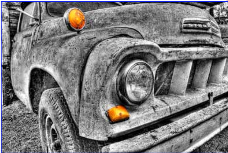
Color B Image of the Month "Studebaker"