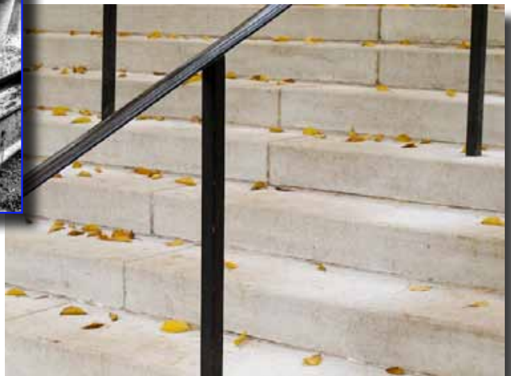
Color B Honorable Mention "Lines"