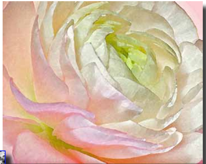
Color AA Honorable Mention "Pink Ranunculus"