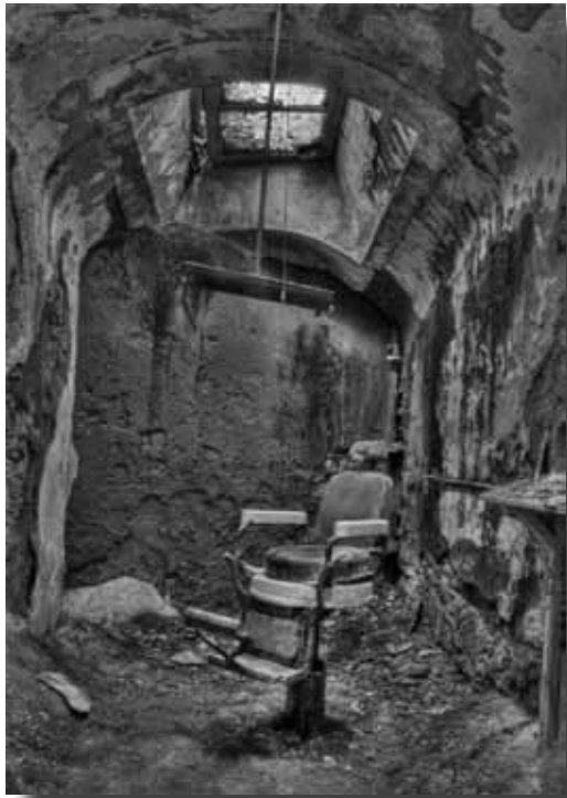
Black & White Honorable Mention "Shave & a Haircut"