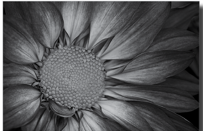
Black & White Image of the Month "Gerber in Grayscale"