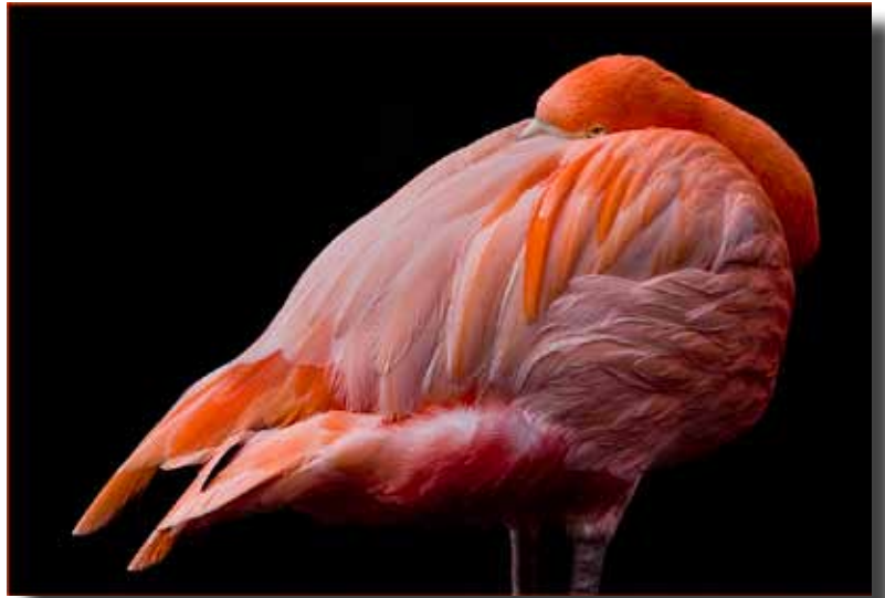
Color AA Image of the Month "Siesta"