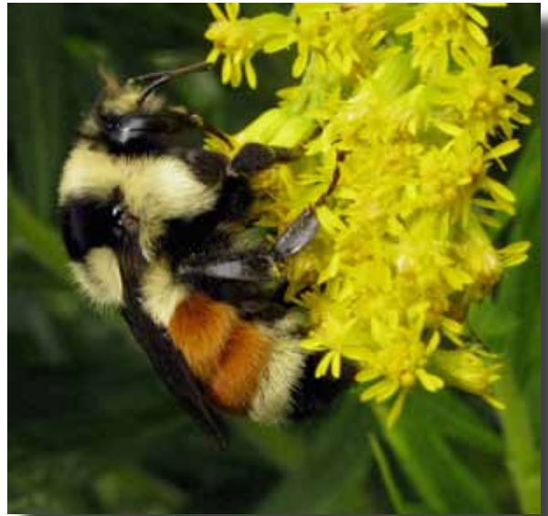
Theme Image of the Month "Pollination"