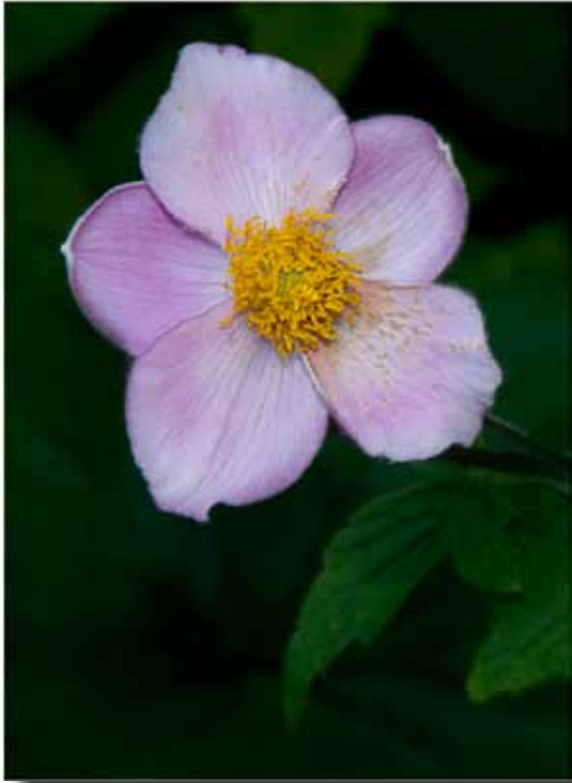
Color A Image of the Month "Flower" © Martin Lewis