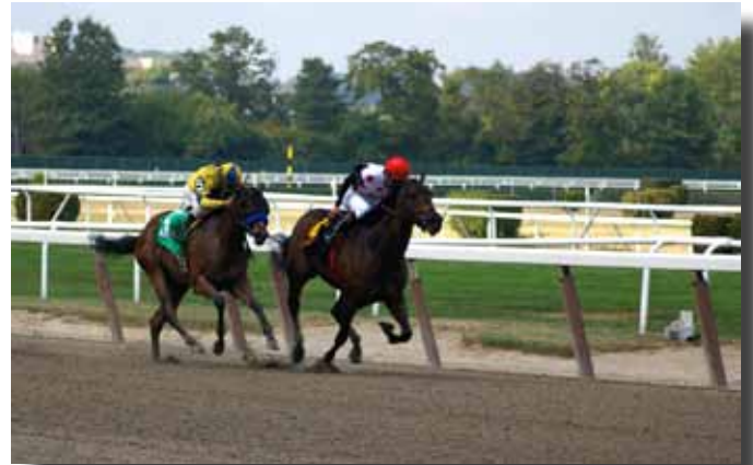
Theme Honorable Mention "Flat Out"