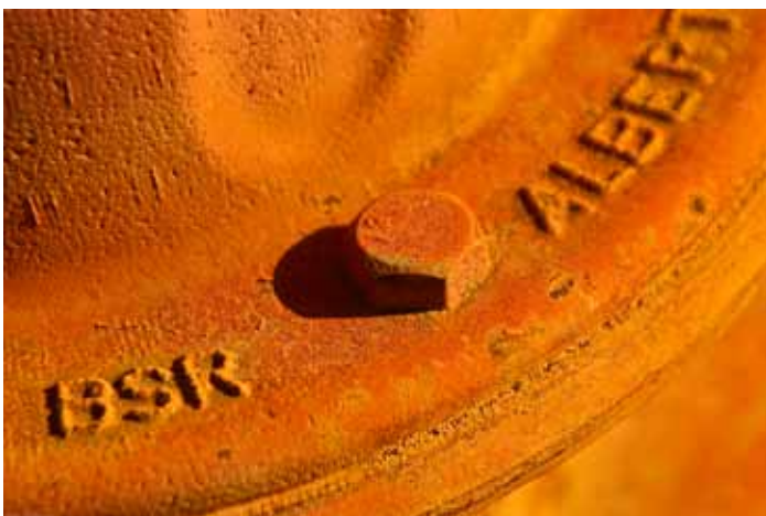
Color B Honorable Mention "Hydrant" © David Feldman