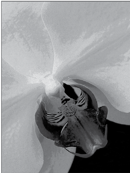
Black & White Image of the Month "Stylized Orchid"