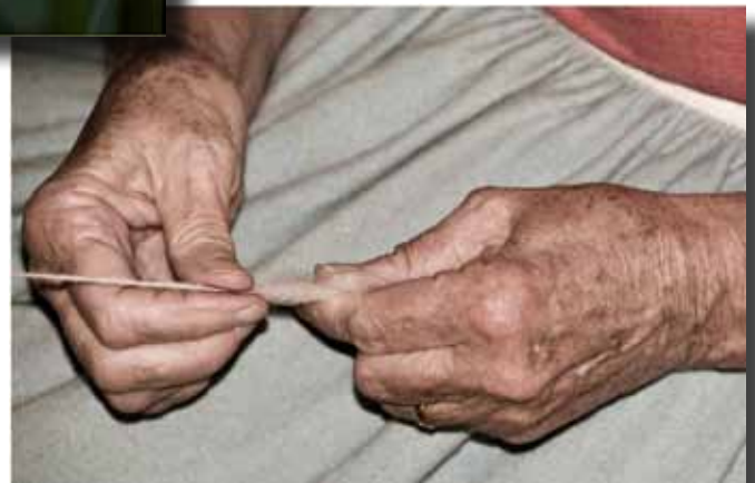
Color A Image of the Month "Spinner's Hands"