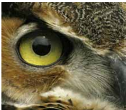
Color B Honorable Mention "Great Horned Owl"