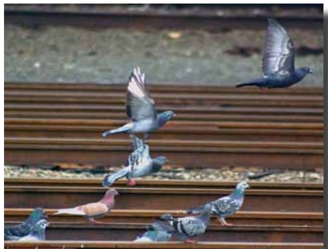
Color B Image of the Month "Pigeons"