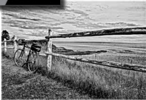
Black & White Honorable Mention "Cape Bear"