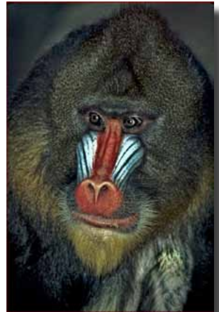
Color A Honorable Mention "Red Nose" © Erwin Krasnow