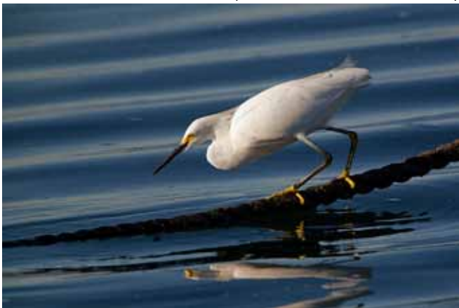
Color AA Image of the Month "Snowy Reflection"