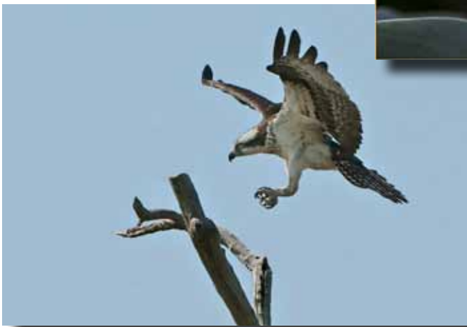
Color AA Honorable Mention "Landing Osprey"