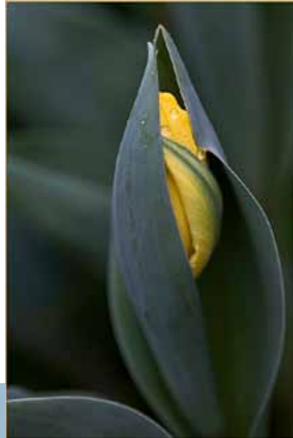
Color AA Image of the Month "Spring Awakening"