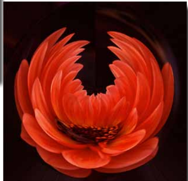
Color A Image of the Month "Shape"