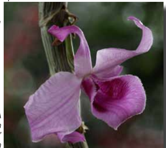
Color A Honorable Mention "Standing Alone"