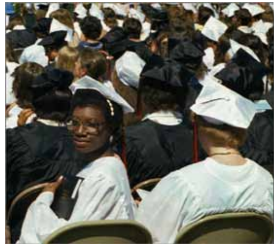
Theme Honorable Mention/November: Standing Out "Graduation"