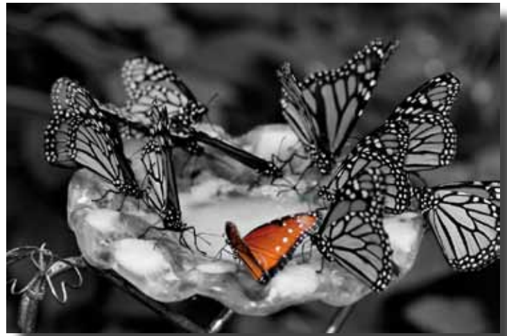
Theme Image of the Month/November: Standing Out "Butterfly"