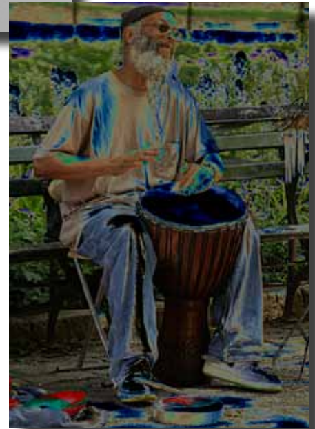
Color B Image of the Month "Park Drummer" © David Feldman