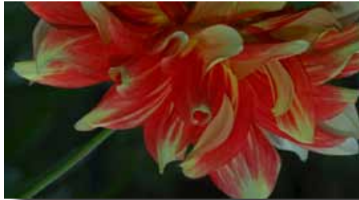
Color AA Honorable Mention "Shaggy Dahlia"