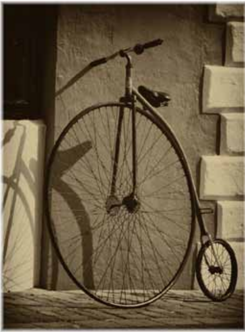
Black & White Image of the Month "Bermuda Bike"