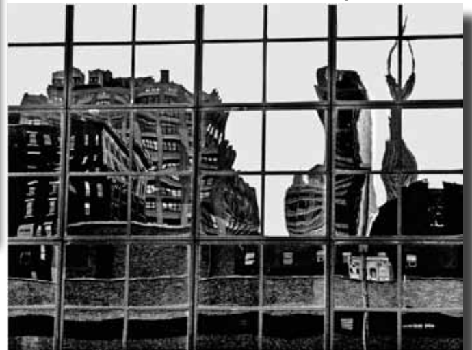
Theme Honorable Mention/December: Reflections "Javits Center"