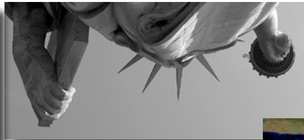
Black & White Honorable Mention "Liberty"