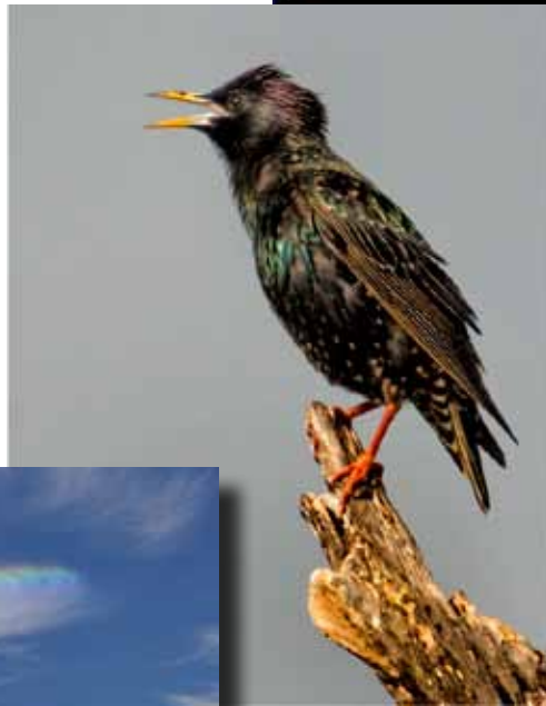
Color AA Image of the Month "Starling"