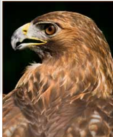
Color AA Honorable Mention "Hawk Portrait"