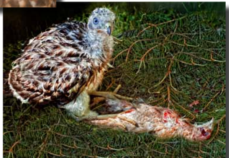
Color AA Image of the Month "Gos Hawk Chowing" - © Anastasia Tompkins