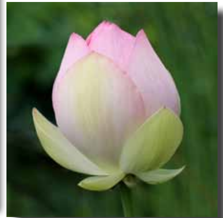
Color A Honorable Mention "Lilly"