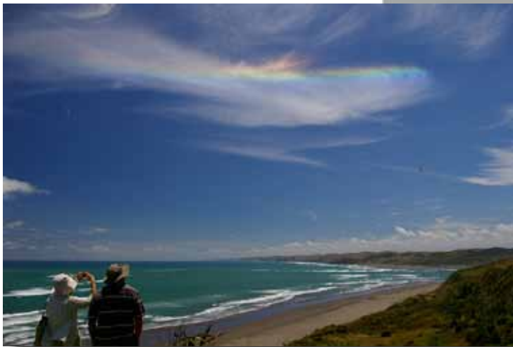
Color B Image of the Month - "Rare Straight Rainbow"