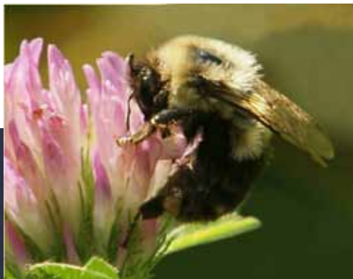
Color B Honorable Mention "Hard at Work"