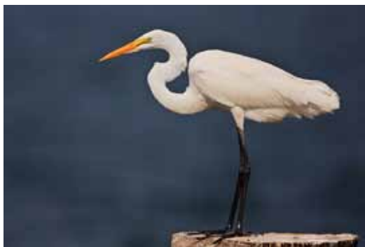
Color AA Honorable Mention "Great Egret"