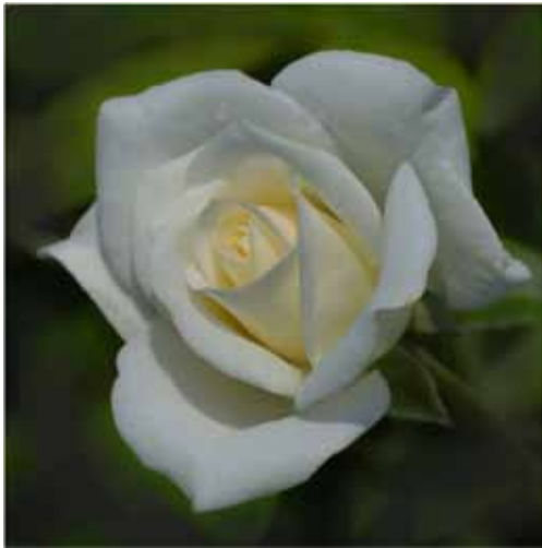
Color A Honorable Mention "Morning Rose"