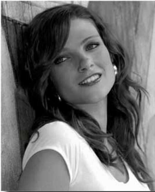
Black & White Image of the Month "Shannah" - © Martin Lewis