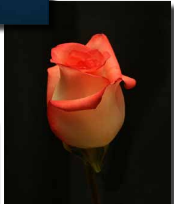
Color B Image of the Month "Serenity"