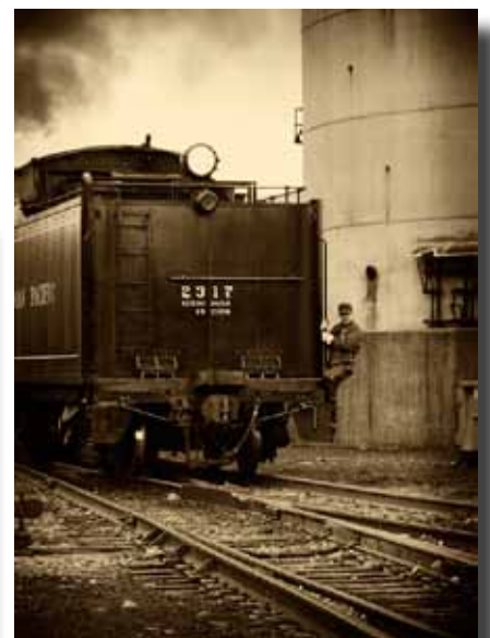
Black & White Honorable Mention "Tender"