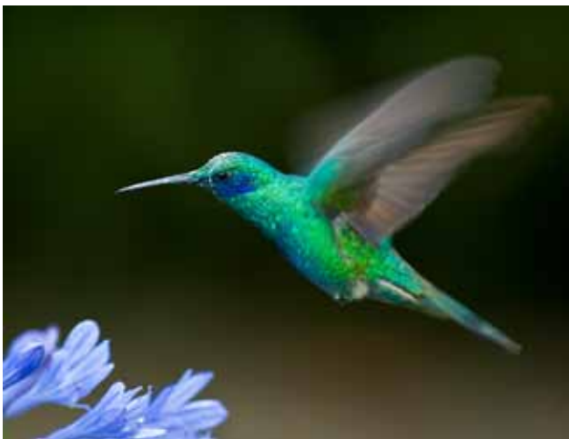
Color B Honorable Mention "Hovering"