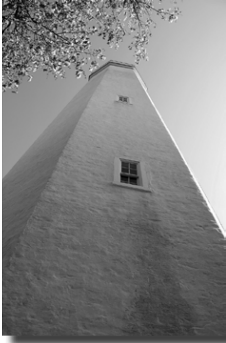
Black & White Image of the Month "Lighthouse"