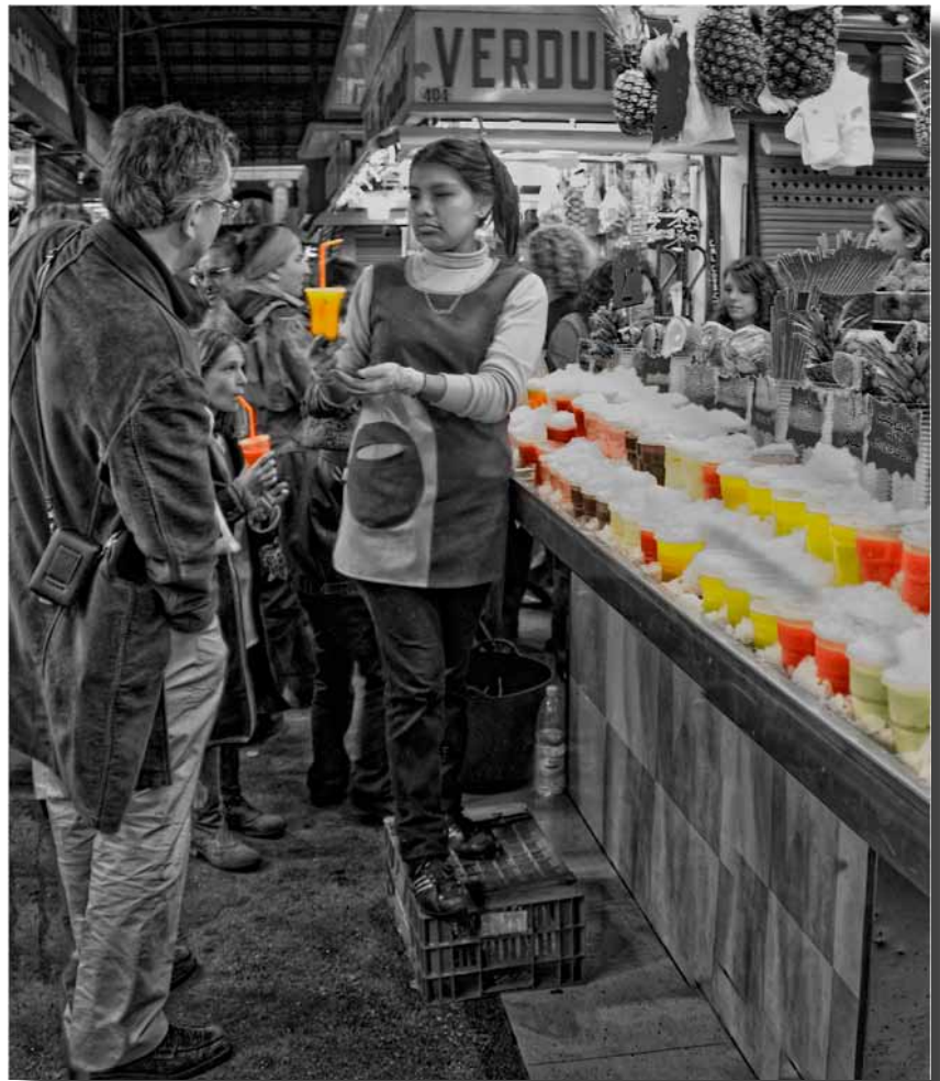
Theme -Street Fair: "Smoothies"