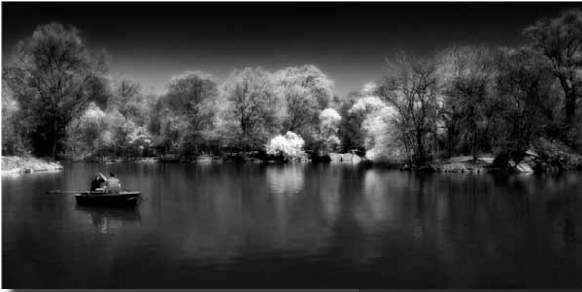
Black & White: "Central Park Boaters"