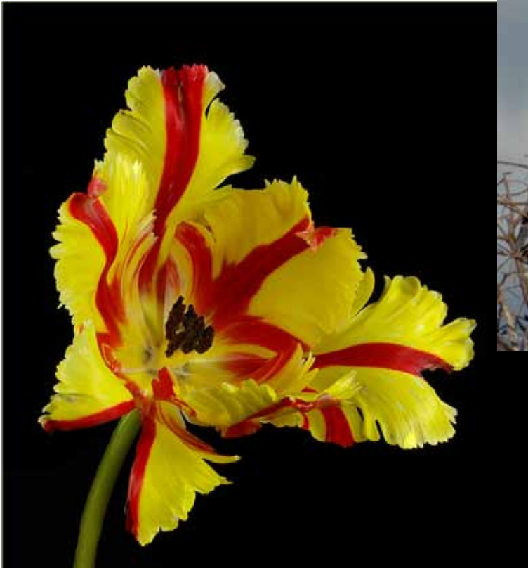
AA: "Ruffles" ©Annabelle Washington