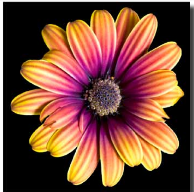
B: "African Daisy" ©Inese Moore

End-of-Year Winners and Photos will be featured in the End-of-Year Program.