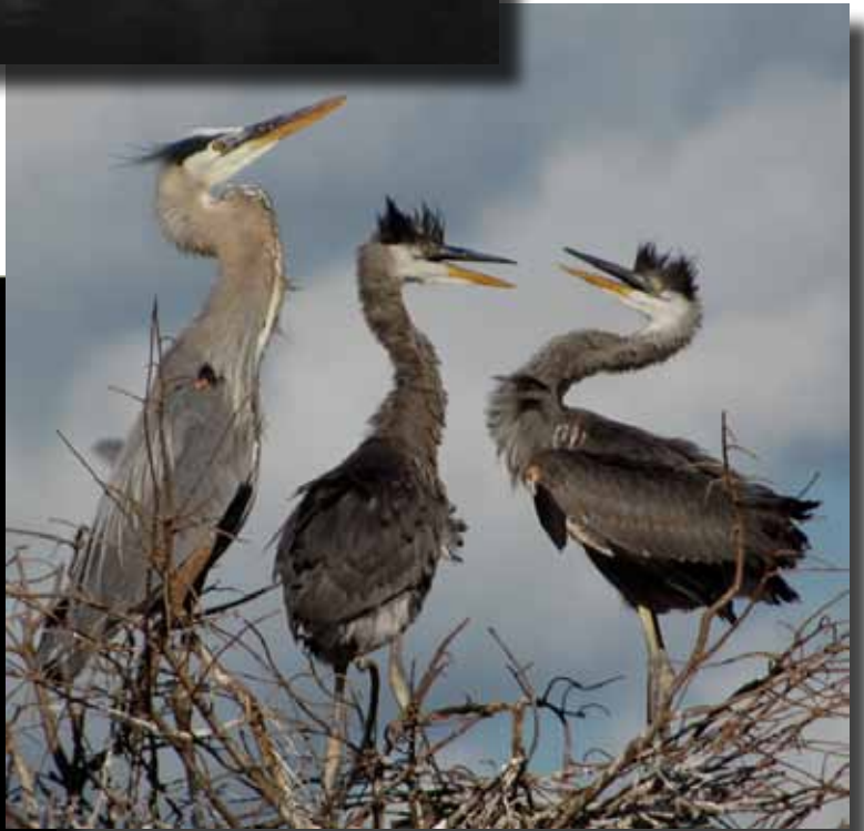
B: "Mindless Chatter" ©Teena Miller