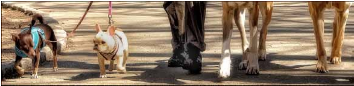
Theme - Hands and/or Feet: "Paws Feet" ©Mel Wilner