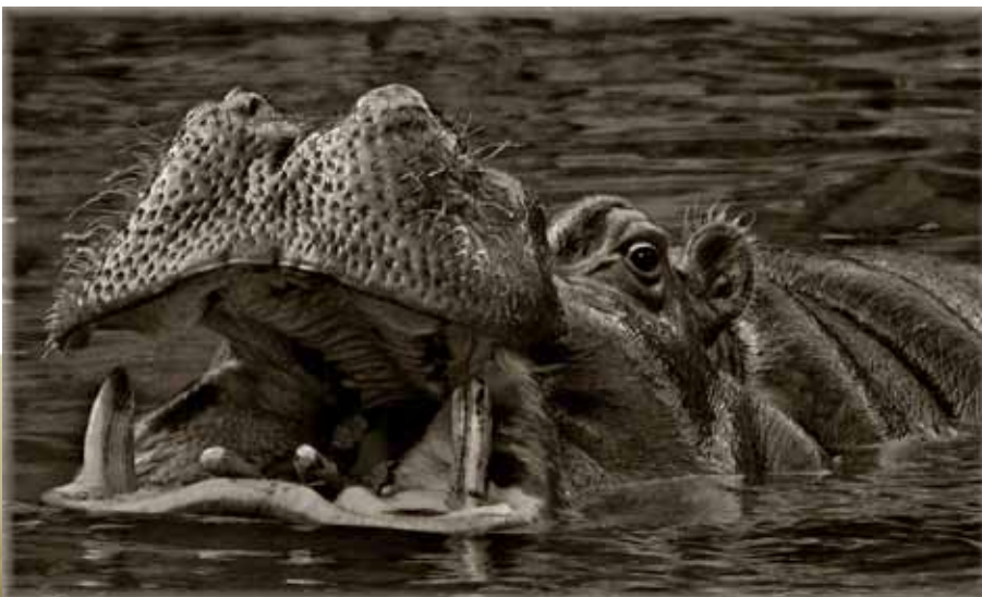
Black & White: "Hippo"