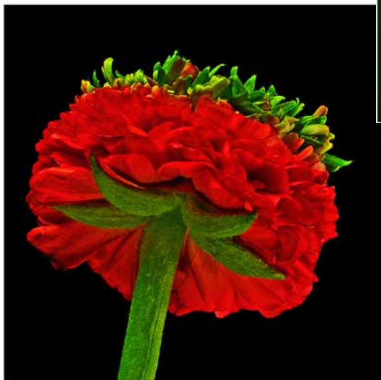
AA: "Rancunculus 2" ©Annabelle Washington