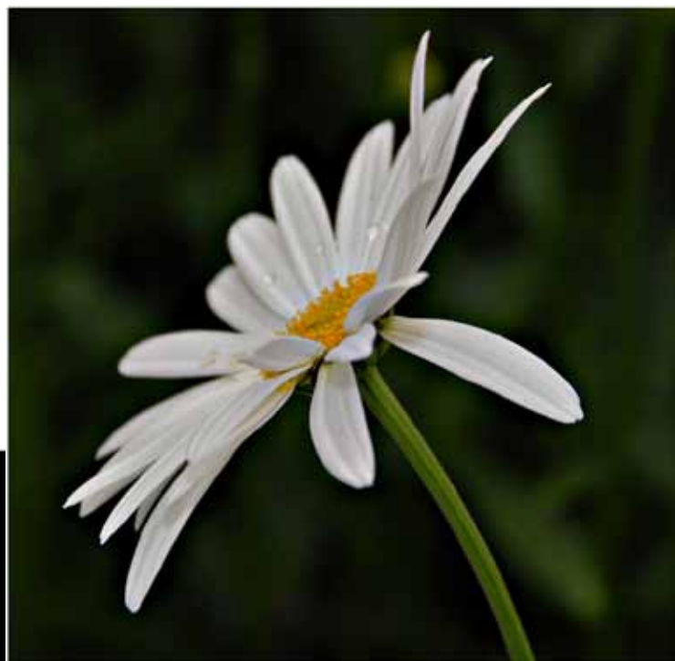
B: "White Flower" ©Veronica Saunders