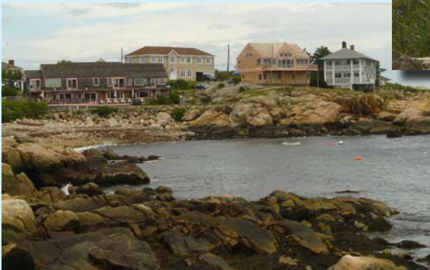
"The Fog Lifts"

Have a story (with photos) to share? E-mail it to: iriseditor@verizon.net .