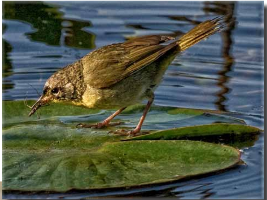
AA: "Gotcha" ©Anastasia Tompkins