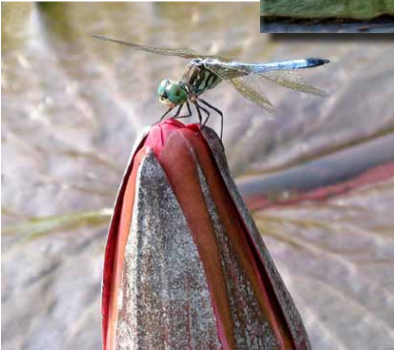
B: "Longwood Dragonfly" ©Lynne West