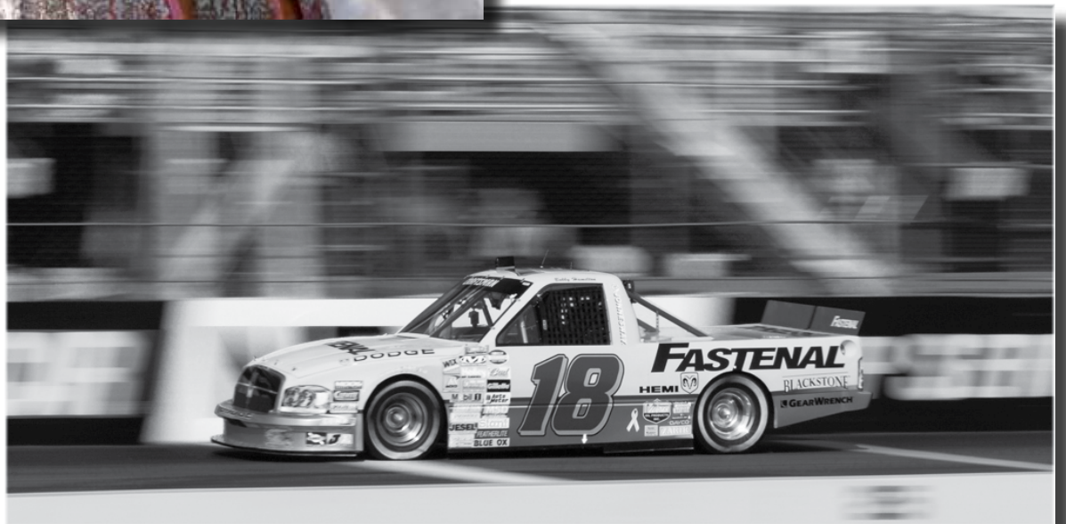
Black & White: "Race" ©Dennis DiBrizzi