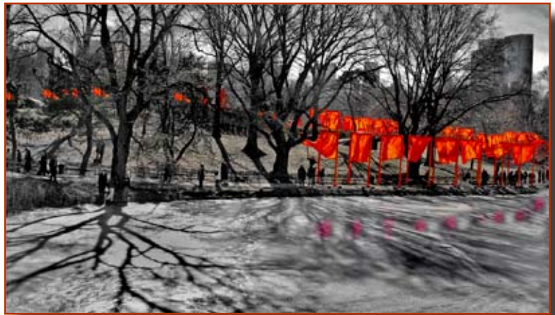
Theme Image of the Month/May • "Gates" - ©Anastasia Tompkins