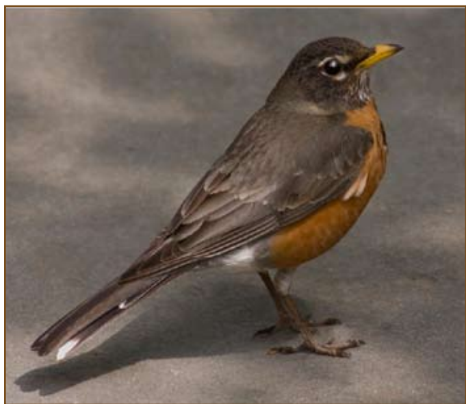
Digital B Image of the Month "Robin"