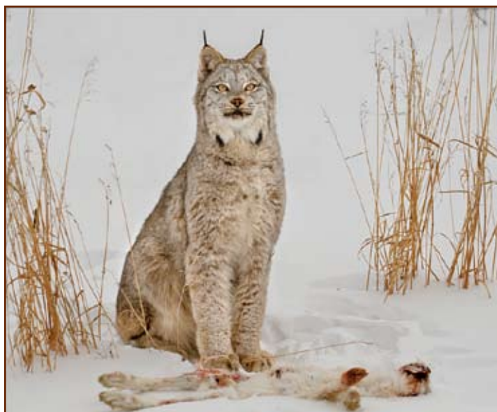
Digital AA Image of the Month "Lynx and Rabbit"