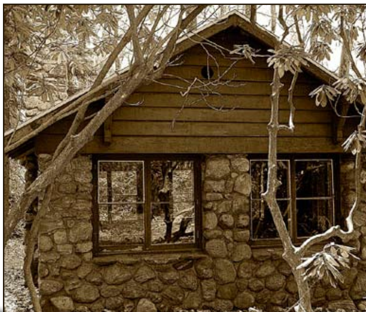
Digital Black & White Image of the Month "Cottage"