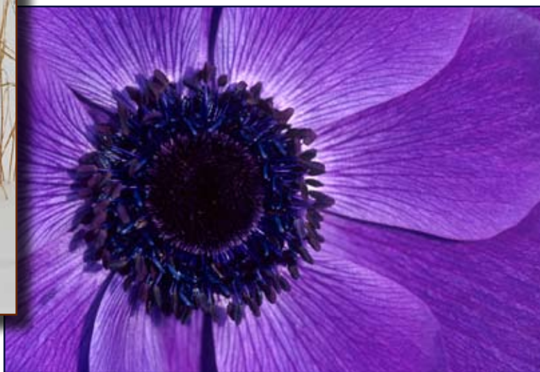
Slide of the Month "The Power of Purple" - ©Linda A. Tommasulo

*Additional winning images are featured in the End-of-Year Program